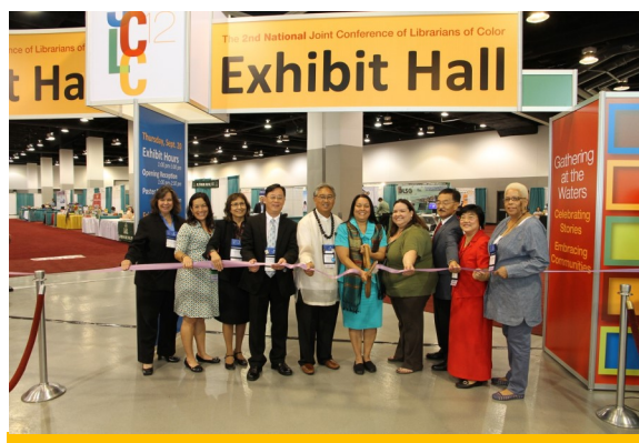
Exhibit Hall Schedule